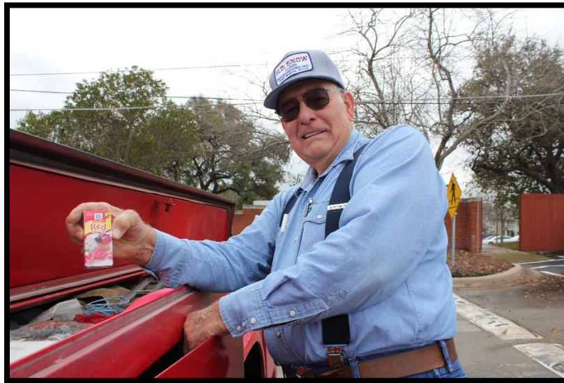
H D Son & Son - Subcontractor 1