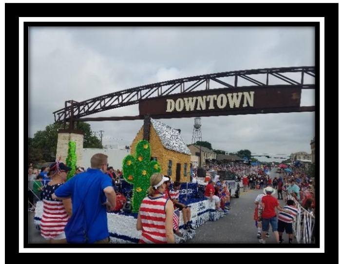
Downtown sign, RR Stagecoach Inn float & Icon RR Water Tower (in one photo)