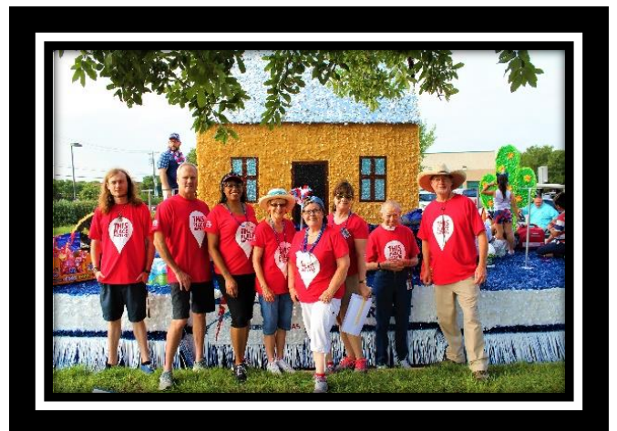
We love the RR Stagecoach Inn float & our red shirts with the "This Place Matters" logo!