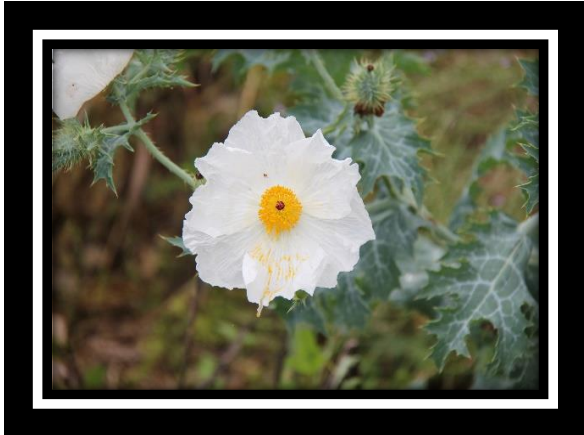
A flower blooming within the Bathing Beach Park